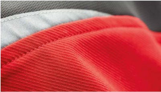
Workwear and protective clothing must meet the toughest requirements.

Workwear can look good, too! Although safety and functionality are always paramount, modern workwear also has to fulfil design and comfort requirements. That's why our workwear sewing threads are impressive in terms of both look and functionality. For leasing and corporate wear in particular, robust sewing threads that can stand up to any kind of stresses are important.